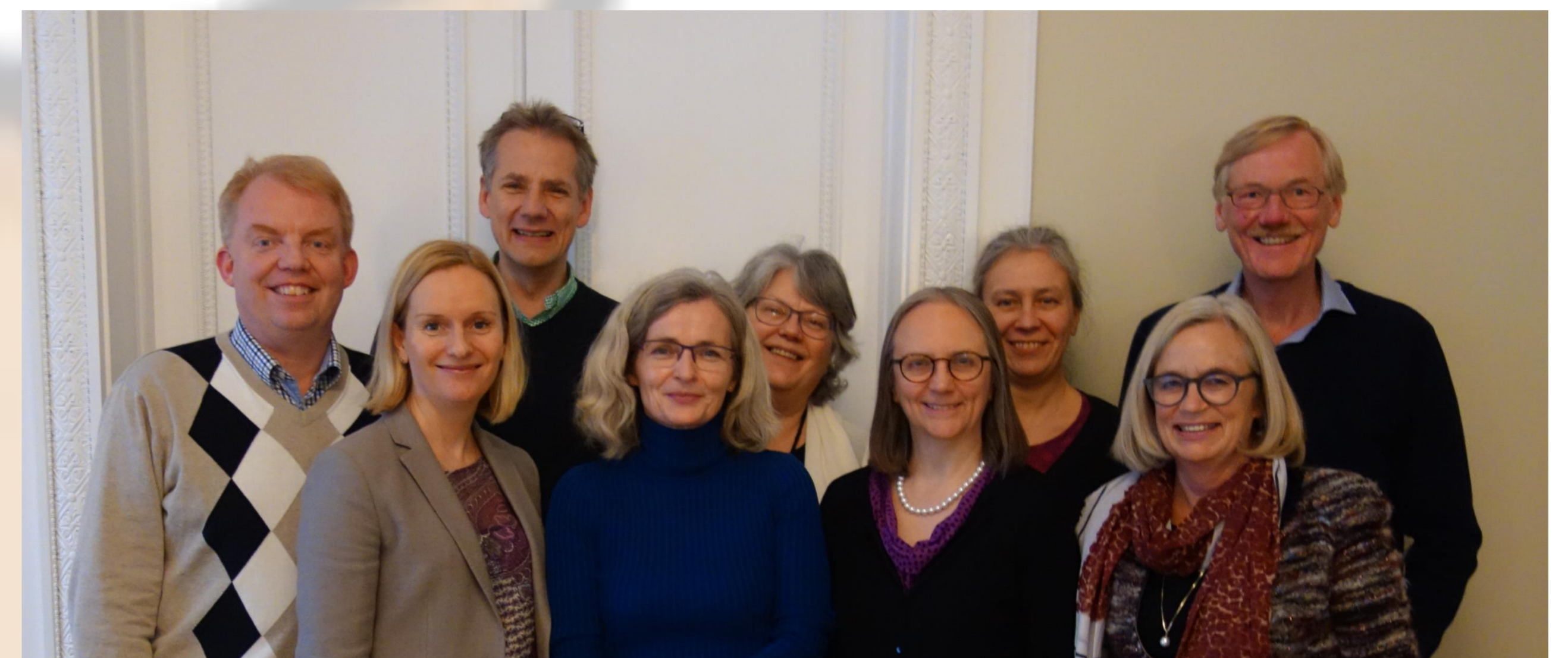
NSCPM Steering Group 2013-2016

Palliative medicine has been approved as a formal competence field or subspecialty in Finland, Norway, Denmark and Sweden and expected in Iceland 2015/2016. In all countries, the Nordic course, or an equivalent course, is required for the theoretical part.